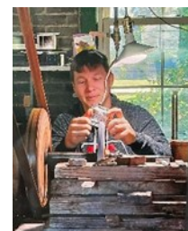
Craftsman cutting glass with original machinery to create intricate design.

October 2025 At the October meeting 1-F Retired chapter members toured Warsaw Cut Glass in Warsaw, IN. Warsaw Cut Glass Company is known for its traditional hand-cut crystal. It is one of the last of its kind in the United States, using original machinery and techniques since 1911. They offer custom glass etching and cutting services creating unique handcrafted pieces with intricate designs and even provide hands-on-workshops where customers can etch their own glassware. The company is locally owned and has preserved its heritage through multiple generations, making it a significant part of local tourism and craftsmanship. Members were given the opportunity to shop while a small group toured the factory. It's amazing to think that machinery over 100 years old is still functioning and being used to create beautiful, intricate designs on glassware yet.