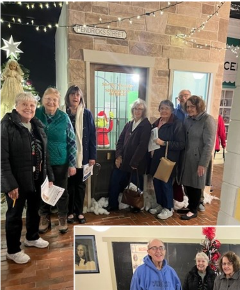
The Blue River retired chapter visited the Christmas Tree Farm and Grover Museum in Shelbyville, Indiana, during their December 6th chapter meeting.