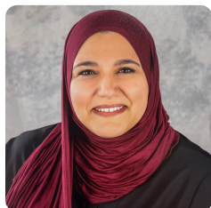
WAF A' SAFI